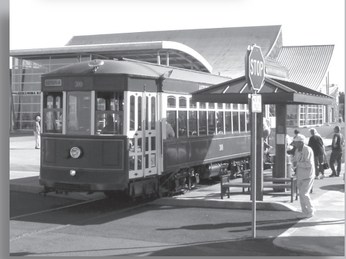
CLATSOP COUNTY FAIRGROUNDS

ASTORIA-WARRENTON AREA CHAMBER OF COMMERCE 111 W. MARINE DRIVE P. O. BOX 176 ASTORIA, OR 97103 (503) 325-6311 1-800-875-6807 www.oldoregon.com